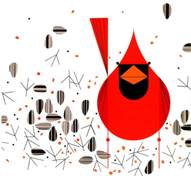
Charlie Harper 48 x 48 Giclee Print

8TH ANNUAL GALA SELLS OUT - HELPS 4,000 PETS LEAD BETTER LIVES